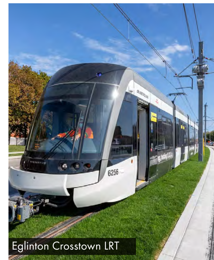
Eglinton Crosstown LRT

Surrounded by some of the most affluent neighbourhoods in the city, Yonge and Eglinton is a hub for trendy boutique stores, national retailers, hip bars and restaurants servicing the families and young professionals that make this one of the top areas to live in Toronto.